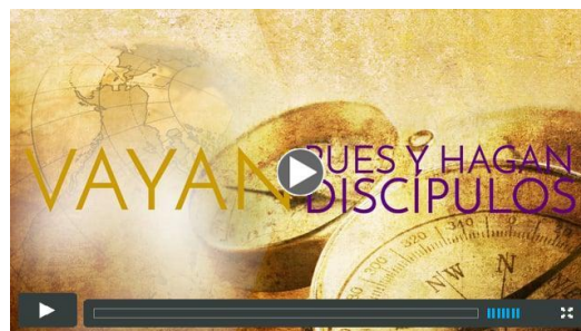
2018 Archbishop's Annual Campaign - Spanish