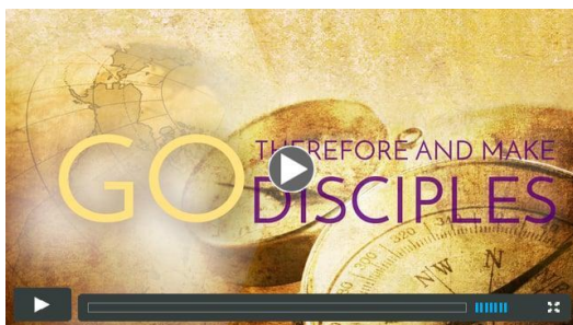
2018 Archbishop's Annual Appeal - English

Please continue to utilize the campaign video on your website, monitors, social media.