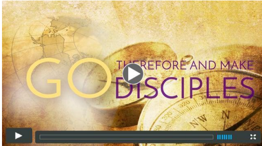
2018 Archbishop's Annual Appeal - English

Please continue to utilize the campaign video on your website, monitors, social media.