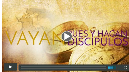
2018 Archbishop's Annual Campaign - Spanish