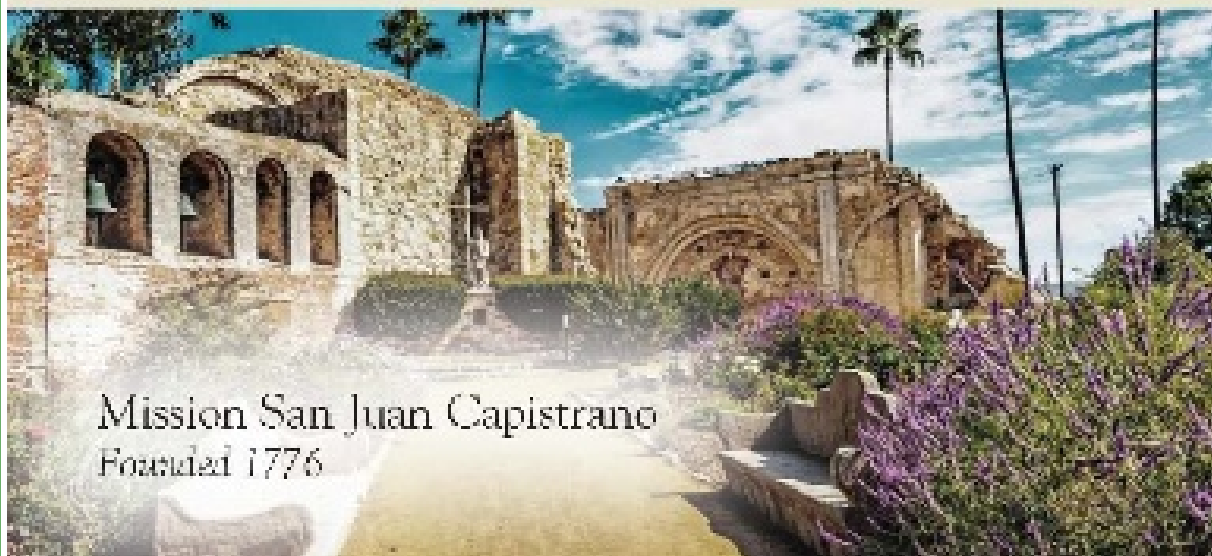
Mission San Juan Capistrano Founded 1776

ANAHEIM, CALIFORNIA | September 27-30, 2020